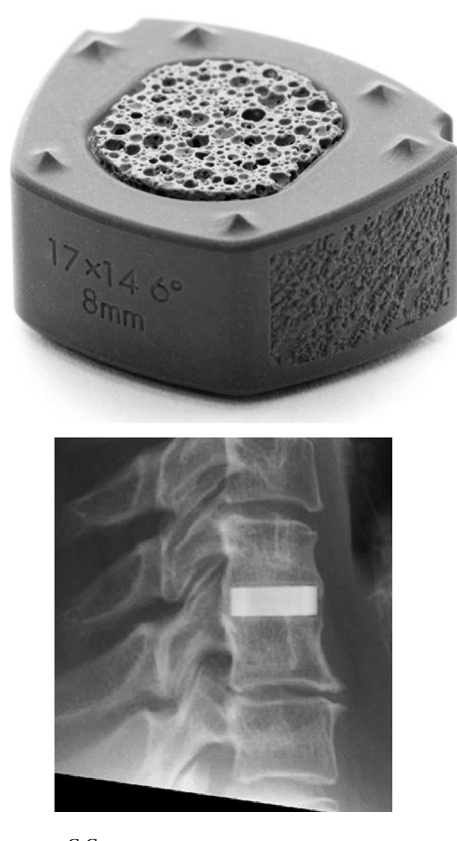
Fig. 1 Valeo C^{CsC} silicon nitride cervical interbody fusion device used in the CASCADE trial with radiographic characteristics

Because PEEK cages have become the gold standard for cervical interbody fusion, the CAncellous Structure